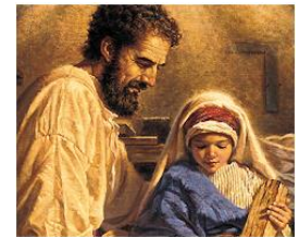
St. Joseph – The Worker